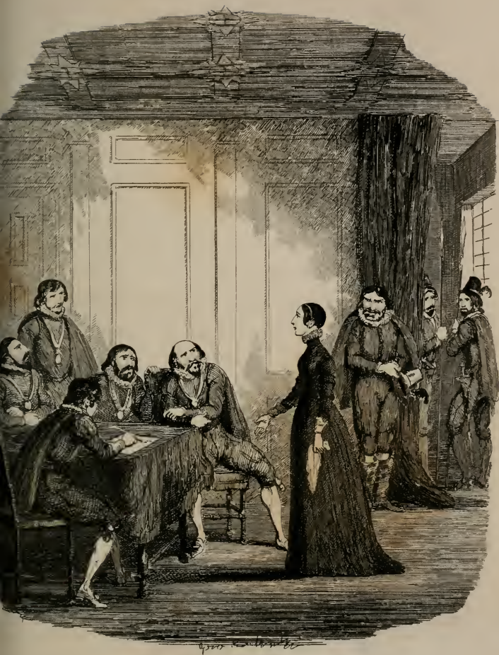
Scene introduced by the Earl of Salisbury, and the Privy Council in St. Paul's Church